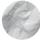
PA 2200 Performance