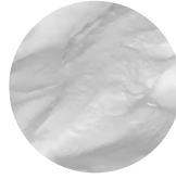
PA 1101 ClimateNeutral