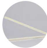
PA 2210 FR