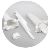
PA 2200 CarbonReduced Balance