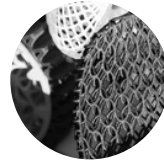
PA 1102 black