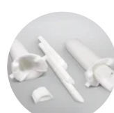
PA 2200 CarbonReduced Performance